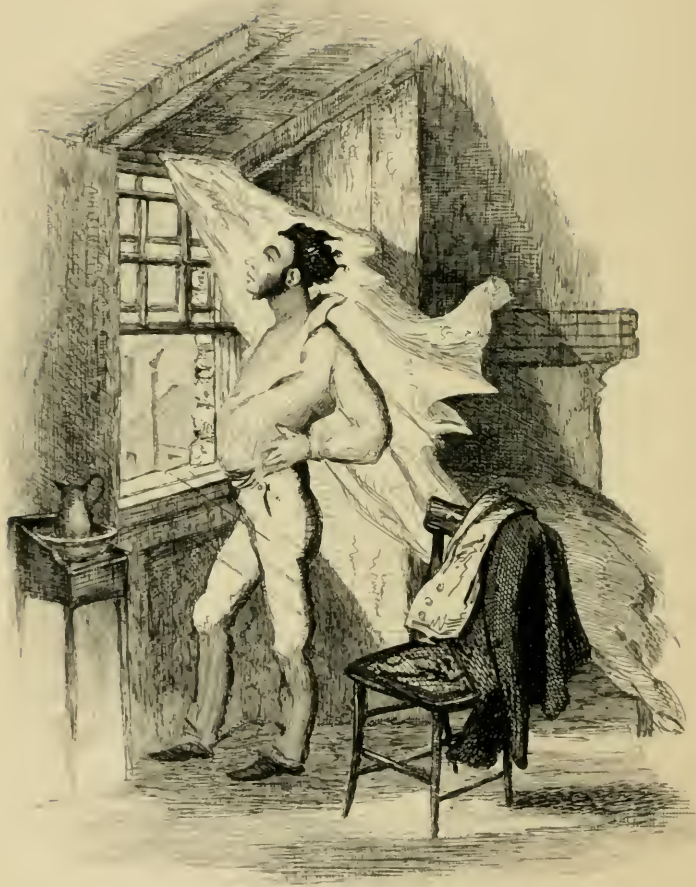
Tom Wray in Suffolk, England, 1848